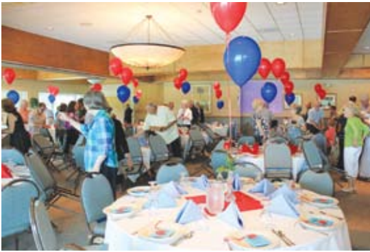
This beautiful room greeted those attending the 50th Reunion, thanks to the hard work the fabulous committee did!