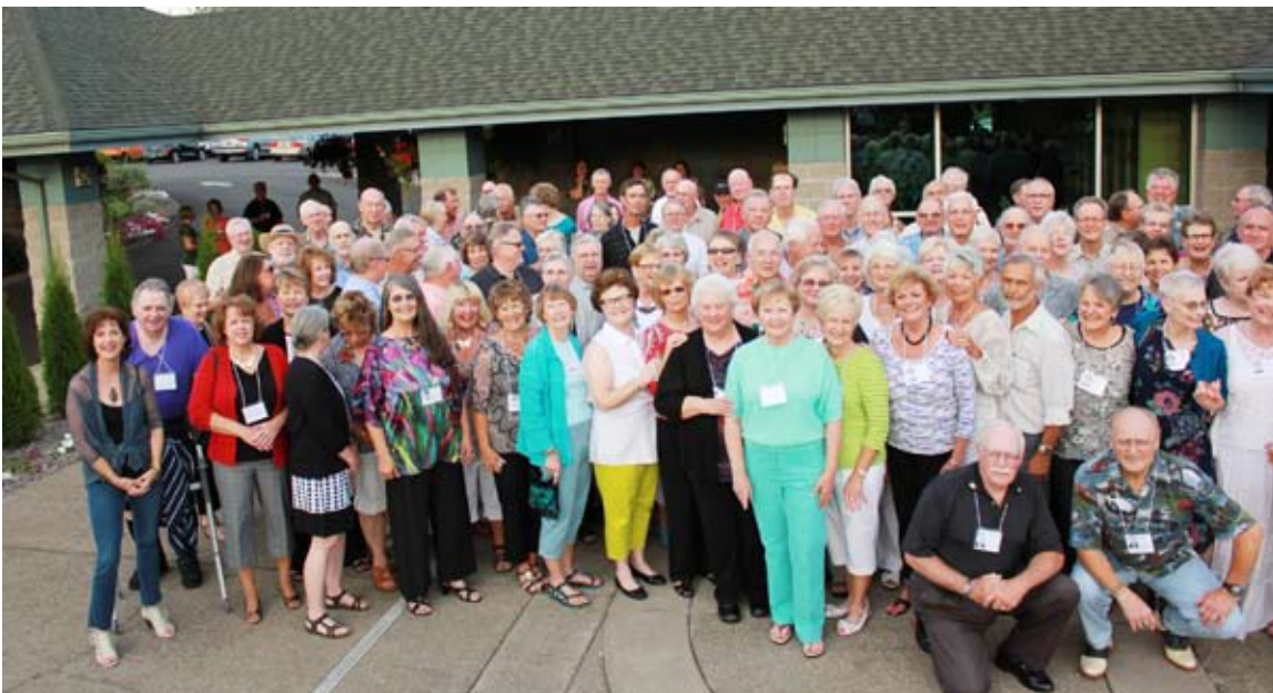
It was hard to get us to quit visiting, as you can tell by this group shot!