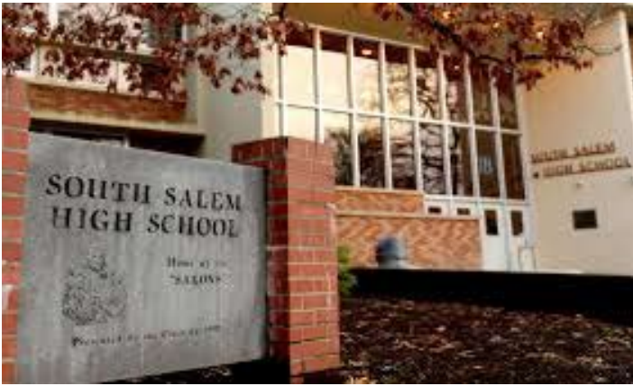
South High Entrance and Lobby

An Overview of the Remodeling going on at South