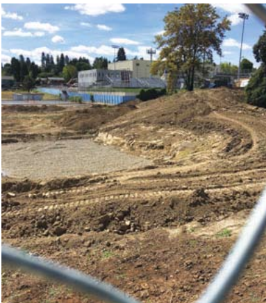
Above: The South Pool, now gone and on the right how the area looks after the buildings were taken down.